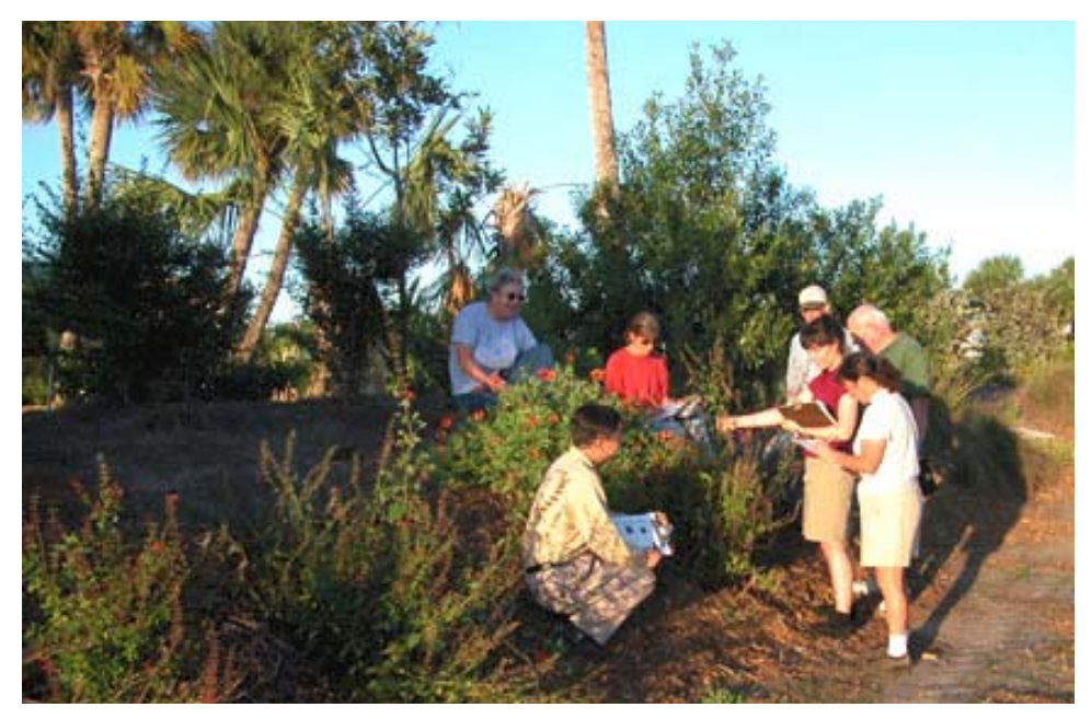
Fig. 1. Undergraduate students taking a plant identification quiz for Florida Native Landscaping (ORH 3815C), Indian River Research and Education Center, University of Florida, Fort Pierce, FL, USA.